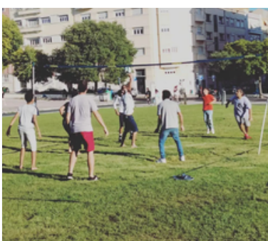
EVANGELISM IN THE PARK