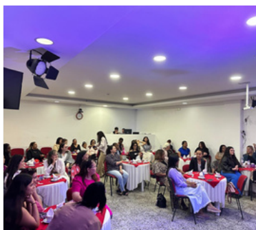
MEETING WITH WOMEN