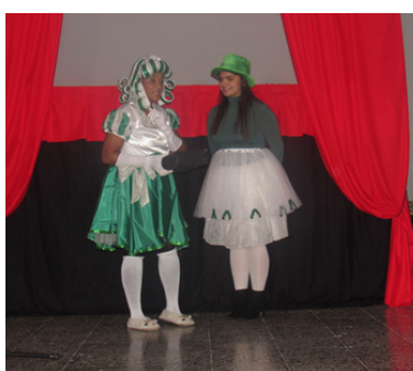
WORKING WITH CHILDREN